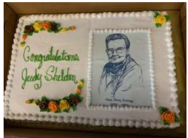
(Cake was delicious)