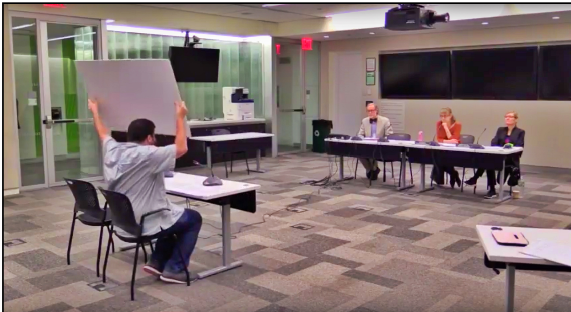
A public hearing at the NYC Dept. of Health & Mental Hygiene, October 24, 2017