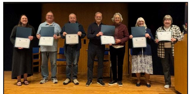
Genealogical society honorees this spring included Charlevoix, Lenawee County, Western Wayne and Detroit.