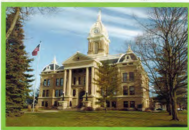
Ingham County Courthouse

Ingham County Courthouse 315 S. Jefferson Mason, Michigan 48854 www.ingham.org